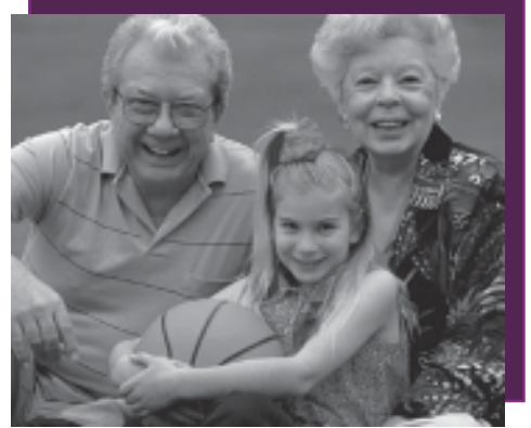
It's about grandchildren.

They are being called the “unsung heroes and heroines of the 21st century.” 1 They are the grandparents parenting the next generation, a responsibility that often proves to be long term. 2 Grandparents raising grandchildren is not a new phenomenon, but Census 2000 data indicate there has been a dramatic increase in the role of grandparents raising grandchildren in the past decade. Other data show that: