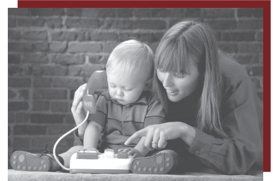
It's about kids.