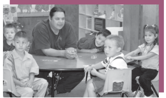
It's about kids.

In October of 2004, the Economic Impact of Child Care in North Dakota report is being released by the North Dakota KIDS COUNT! program. While much has been written about the social and educational benefits of child care, this report outlines the